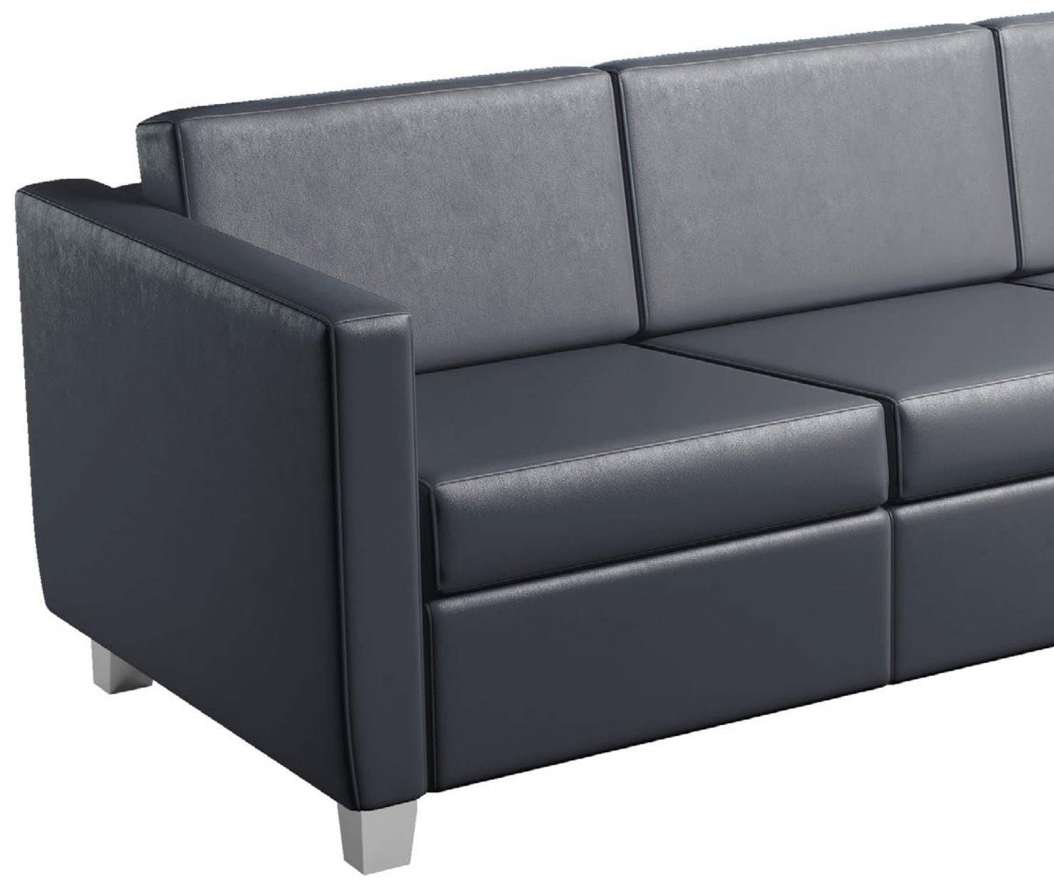
Danforth II 1223-CH